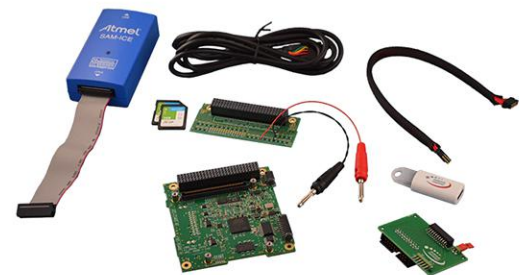
iOBC product contents

This document is subject to change without notice. Latest information is on www.isispace.nl