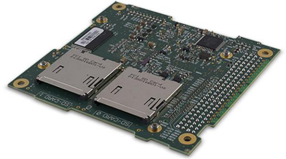
SD card slots