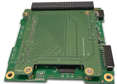
iOBC with FM Daughter Board